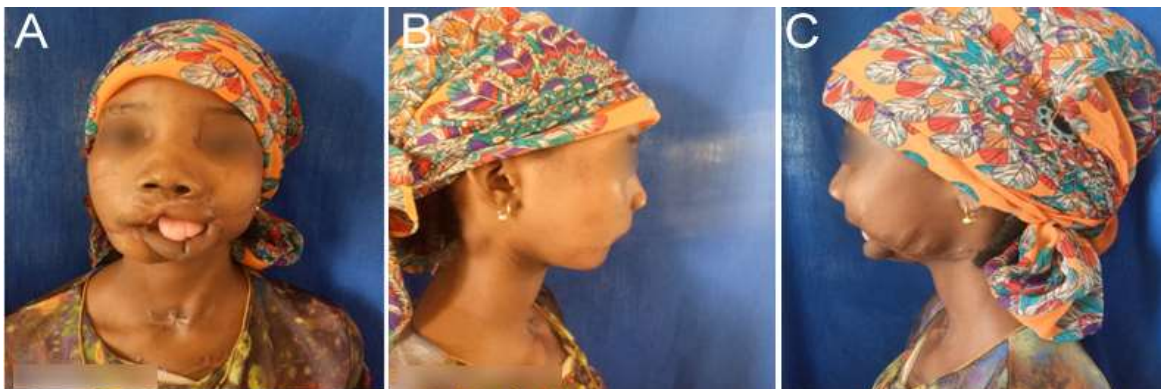
Figure 2. 5 months post-op pictures.

bilateral deltopectoral pedicled flaps was done. The left was extended and used to reconstruct the upper lip while the right was used for the lower lip. A neck flexion splint was applied and the patient was placed on Glyco-P injection.